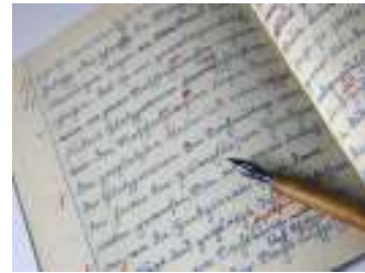
a writing book