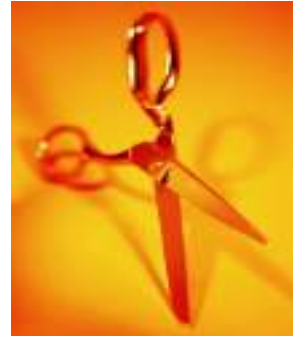
a pair of scissors